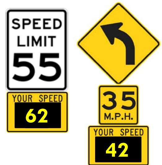
Examples per VDOT Policy