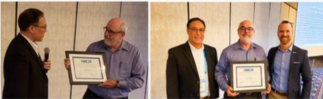
NATIONAL ASSOCIATION OF COUNTY ADMINISTRATORS

At NACo, I sit on the National Health Steering Committee where we discussed mental health for the incarcerated and indigent. Studies show that 50+ percent of inmates have a mental illness. Simply locking them up with no options for treatment costs more money, is harmful to families, and results in higher rates of recidivism. This is why I pushed to ensure Loudoun County was a Stepping Up County to treat inmates and reduce recidivism.